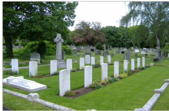
Wandsworth (Earlsfield) Cemetery, London